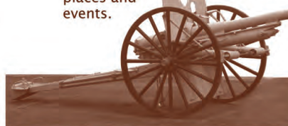
Photo carousels throughout the museum chronicle the historical visual representations of people, places and events.

One room of the museum is devoted to artifacts of the local Northcoast Tolowa and Yurok people.